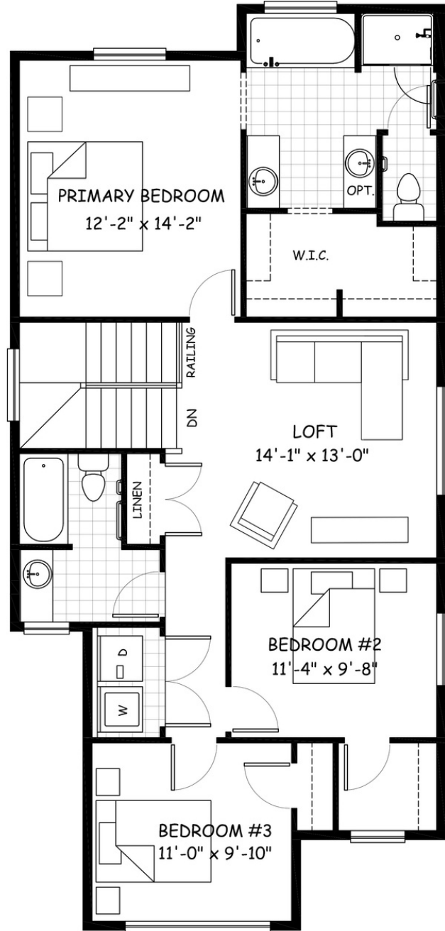
UPPER 1027 sq.ft.