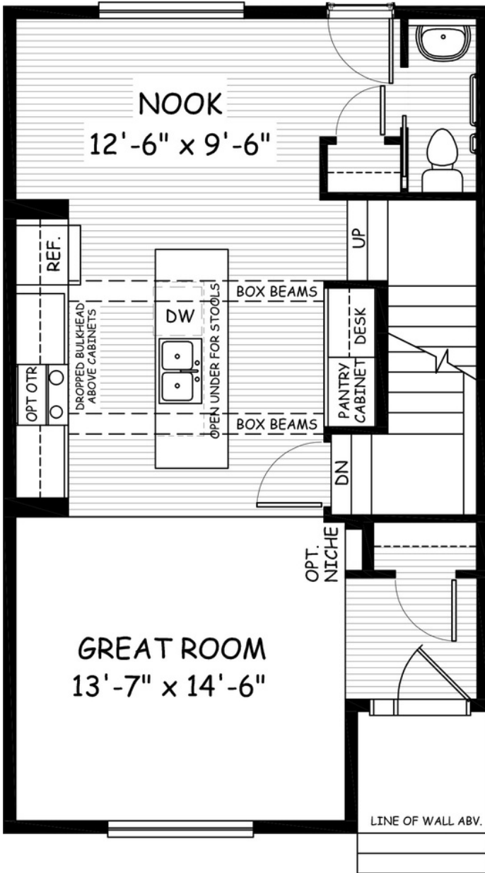
MAIN 653 sq.ft.